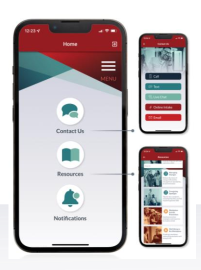
Perspectives LTD App