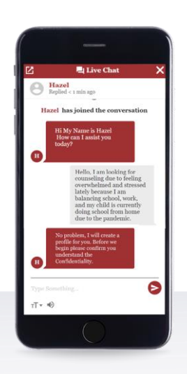
WorkLife Live Chat